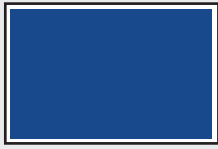
Spread 14 3 / 4 " x 10" non-bleed 15 3 / 4 " x 11" bleed

53,782 BPA-AUDITED SUBSCRIBERS 46,505 PRINT / 7,277 GLOBAL DIGITAL EDITION 1